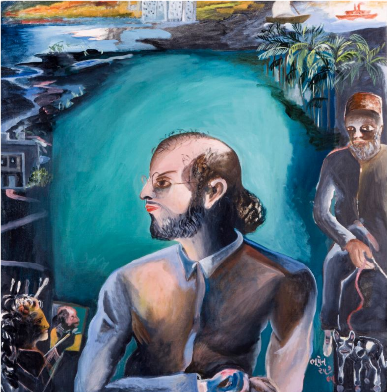
Salman Rushdie (The Moor) , Bhupen Khakhar, 1995