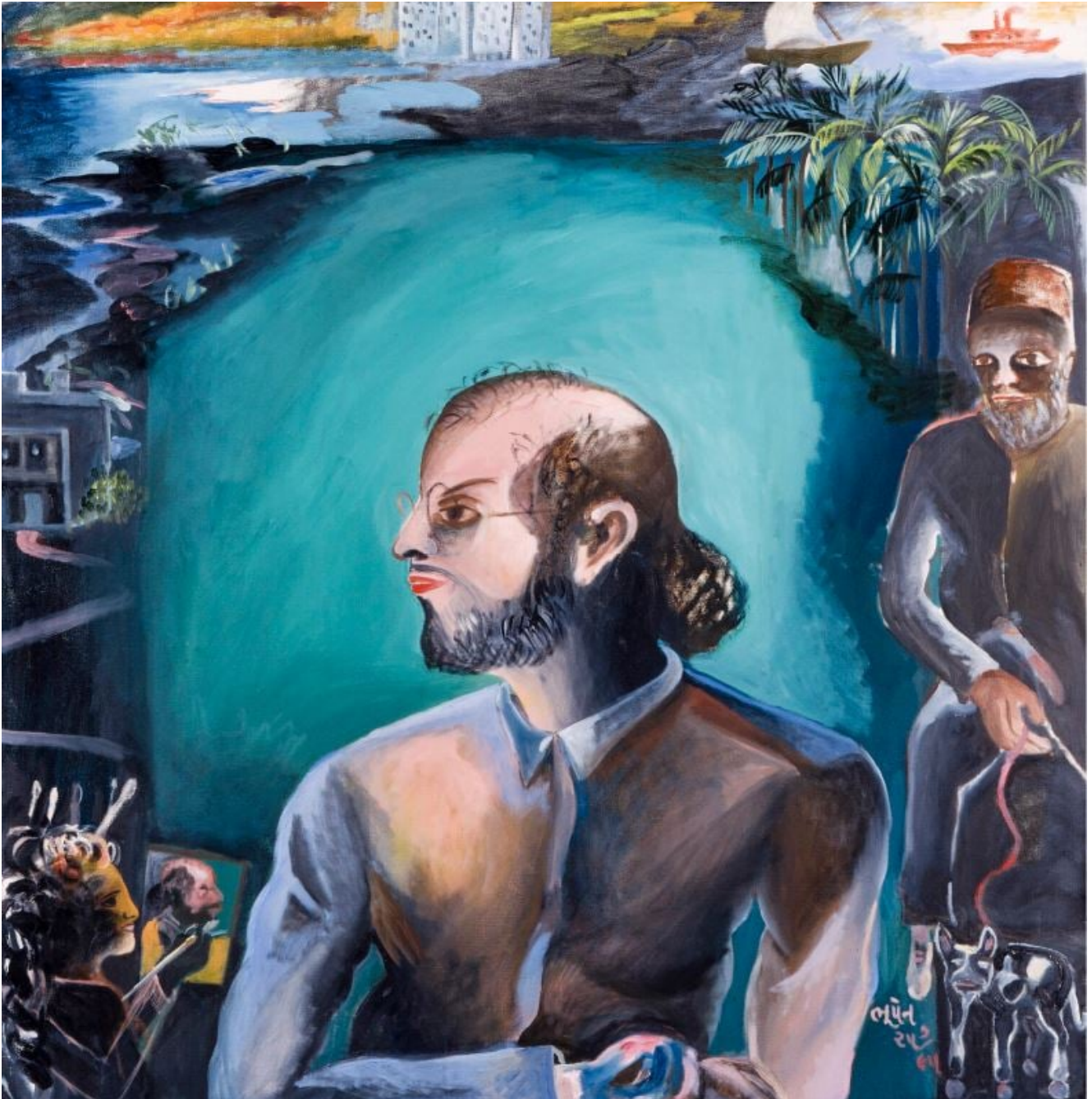
Salman Rushdie (The Moor) , Bhupen Khakhar, 1995