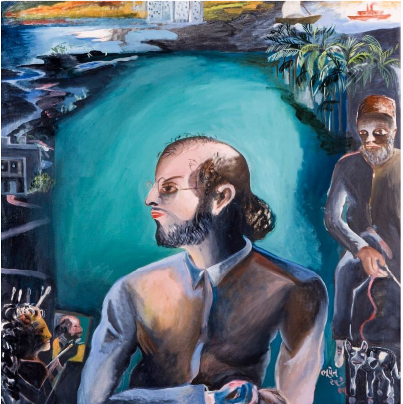
Salman Rushdie (The Moor) , Bhupen Khakhar, 1995