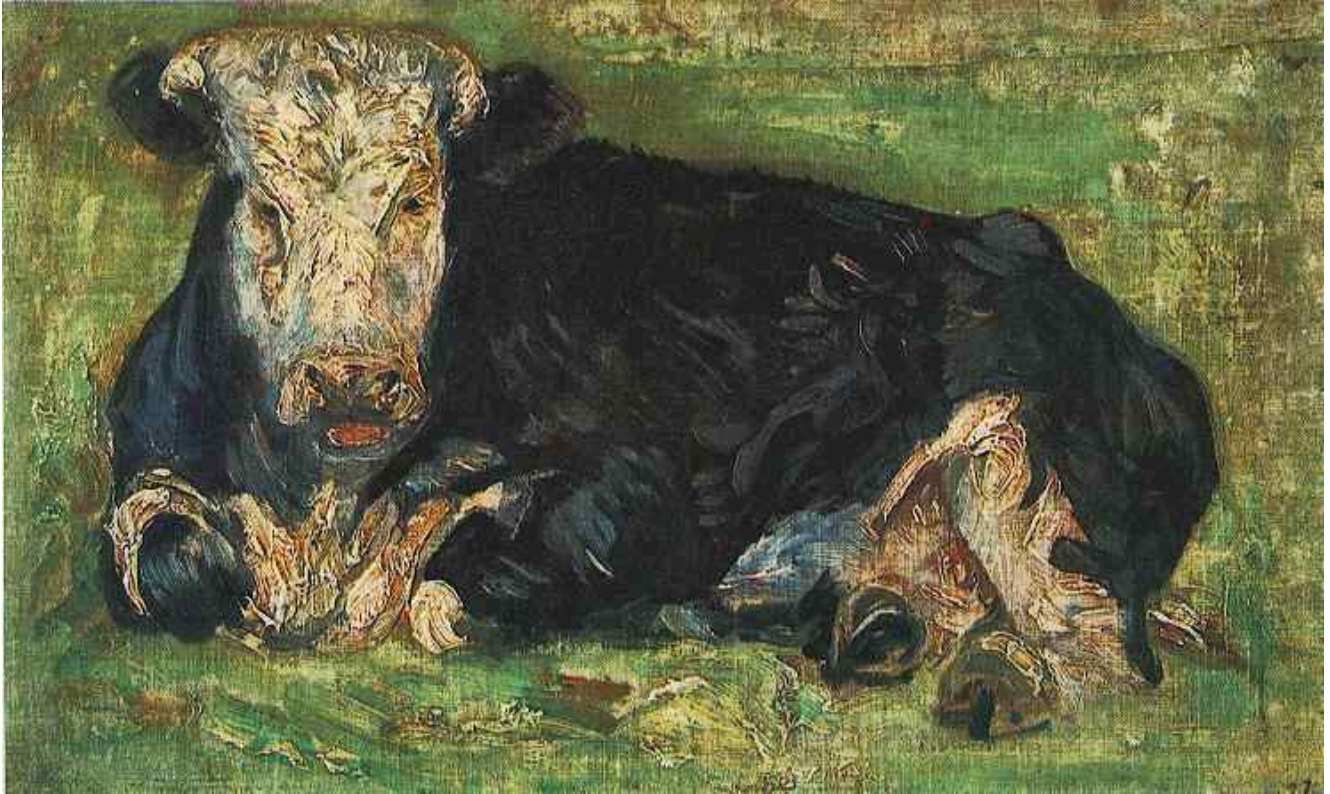
Lying Cow (Vincent van Gogh, 1882)

In fictional accounts of legal confrontations, both on TV and in the movies, truth is presented as a powerful force. So much so that many of us share the opinion of an accused man who was once discussing his problems with F. Lee Bailey, a nationally acclaimed attorney: “I don’t need a lawyer because I’m innocent.”