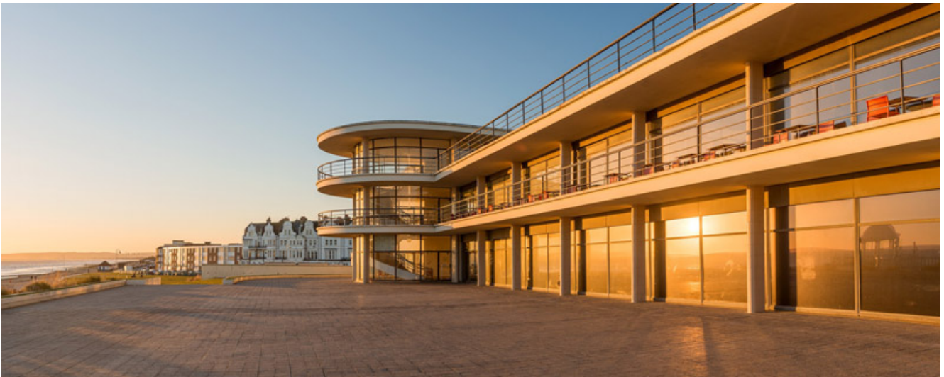
De La Warr Pavilion, Bexhill On Sea, East Sussex

The term bellwether derives from the practice of tying a bell around the lead sheep to guide the flock to grazing rounds and back home. It applies to the seaside town of Bexhill in East Sussex on the English Channel coast where I now make my home after relocating from Florida last year. Little did I know at the time how much I would discover about the town's many innovations, its progressive and non-conformist leaders in setting social and political trends as well as architectural achievements that won international recognition. Various styled as "modernist," "streamlined" architecture with curved forms and art deco stylistic features in the Bauhaus tradition