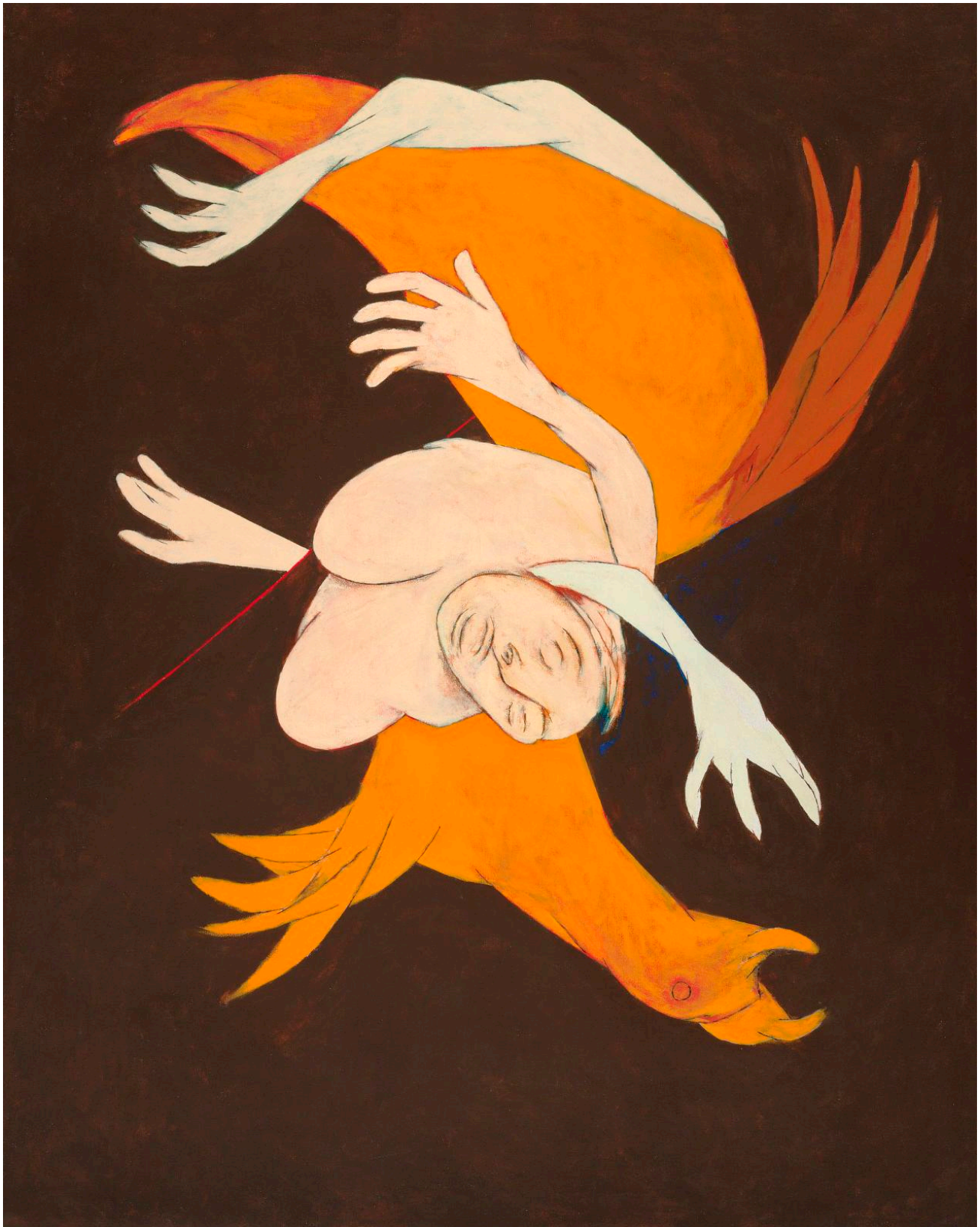
Falling Figure with Bird , Tyeb Mehta, 2002