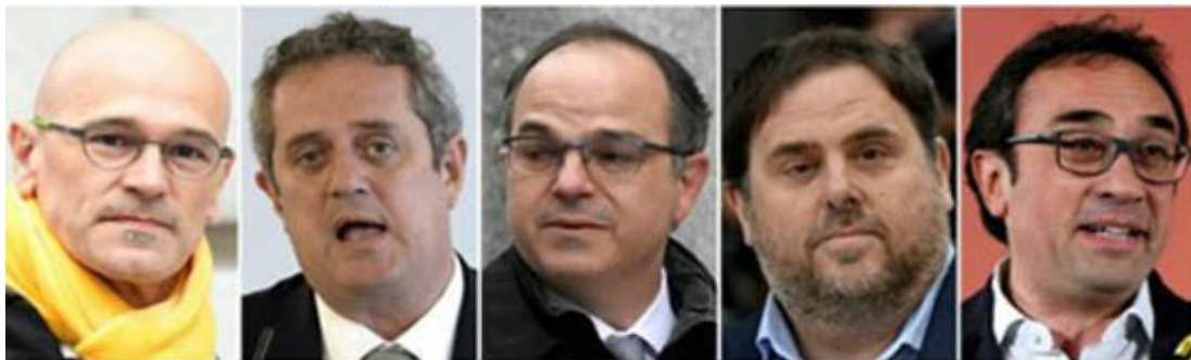
Raül Romeva Joaquim Forn Jordi Turull Oriol Junqueras Josep Rull

Among the twelve defendants in the Supreme Court trial, nine were former members of the Catalan government during the presidency of Carles Puigdemont; one was the president of the regional Parliament and two were activists of Catalanist associations strongly implicated in the separatist cause.