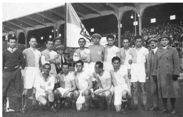
HaKoah Football Club, 1925

Jewish excellence in many intellectual fields enjoys worldwide renown but one unintended consequence of these achievements, symbolized by numerous Noble prizes, has been to diminish and obscure similar Jewish preeminence in numerous athletic events and team sports, similarly out of all proportion to the Jewish populations of the countries in which these athletes were chosen to represent in international competition.