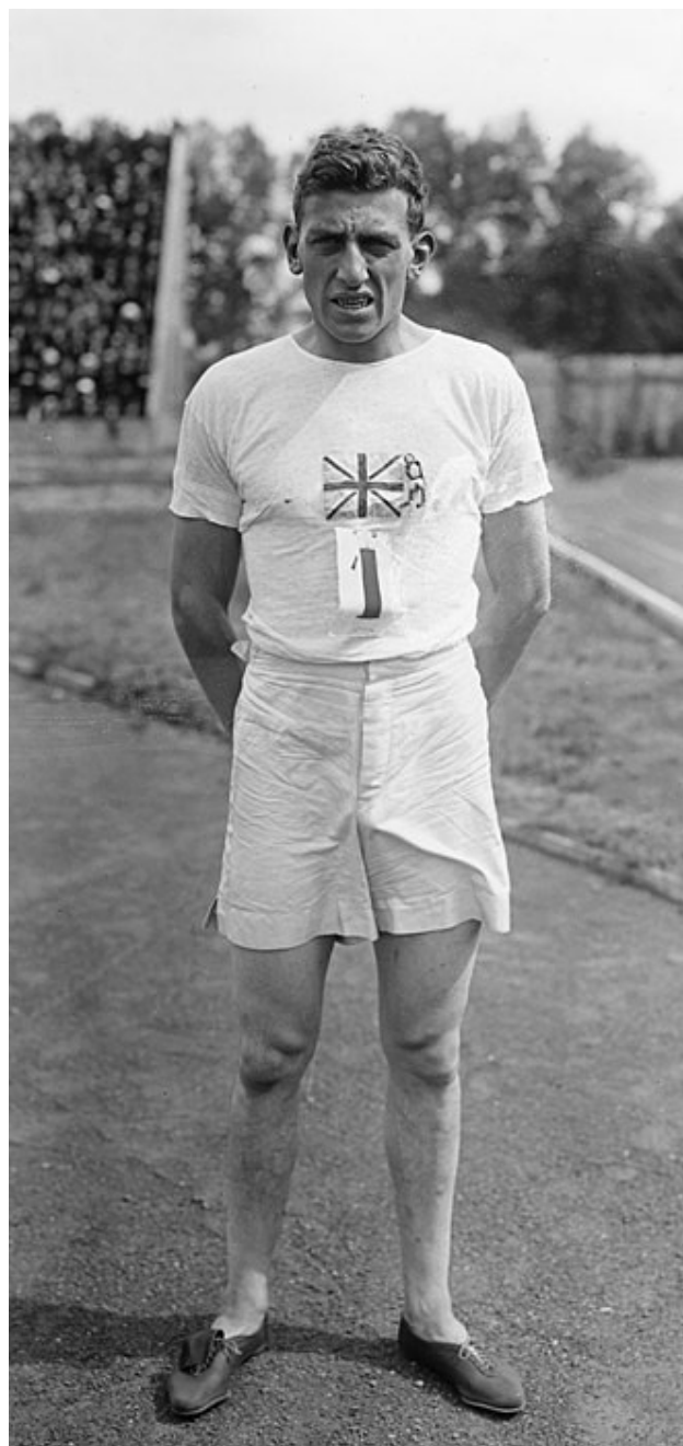
Harold Abrahams, 100 meter sprint gold medal winner, 1924

Even the team called the "New York Americans" was made up almost primarily of foreign-born Jews. Yes, there was an aspect of pride for fans back then who were proud of their sons, fathers, cousins and uncles displaced from Europe or Latin America and first-generation immigrants to the U.S and who played for the love of the game and to demonstrate their ethnic pride but it was light-years away from the superstar status and megabuck professional game and the World Cup.