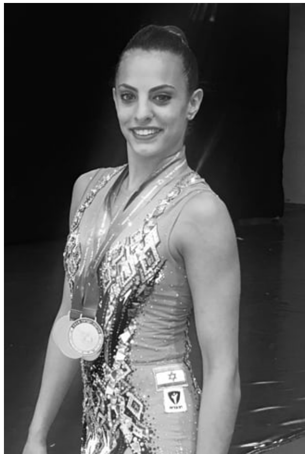
Linoy Ashram, Israeli gold medal winner in Rhythmic Gymnastics, 2020 Olympic Games.

In the 1932 Olympics in Los Angeles, Denmark's Greco-Roman wrestling champion Abraham Kurland, a member of the HaKoah Jewish Sports fraternity, won a silver medal that garnered scant attention, but all those professionals in his sport confidently predicted that he was the heavy odds-on favorite and would easily win gold in the 1936 Olympics. Kurland did not participate, however. As a Jewish athlete, he knew full well that the 1936 games violated every ethical precept that the initiators of the Olympic Games had established and hoped for in previous years.