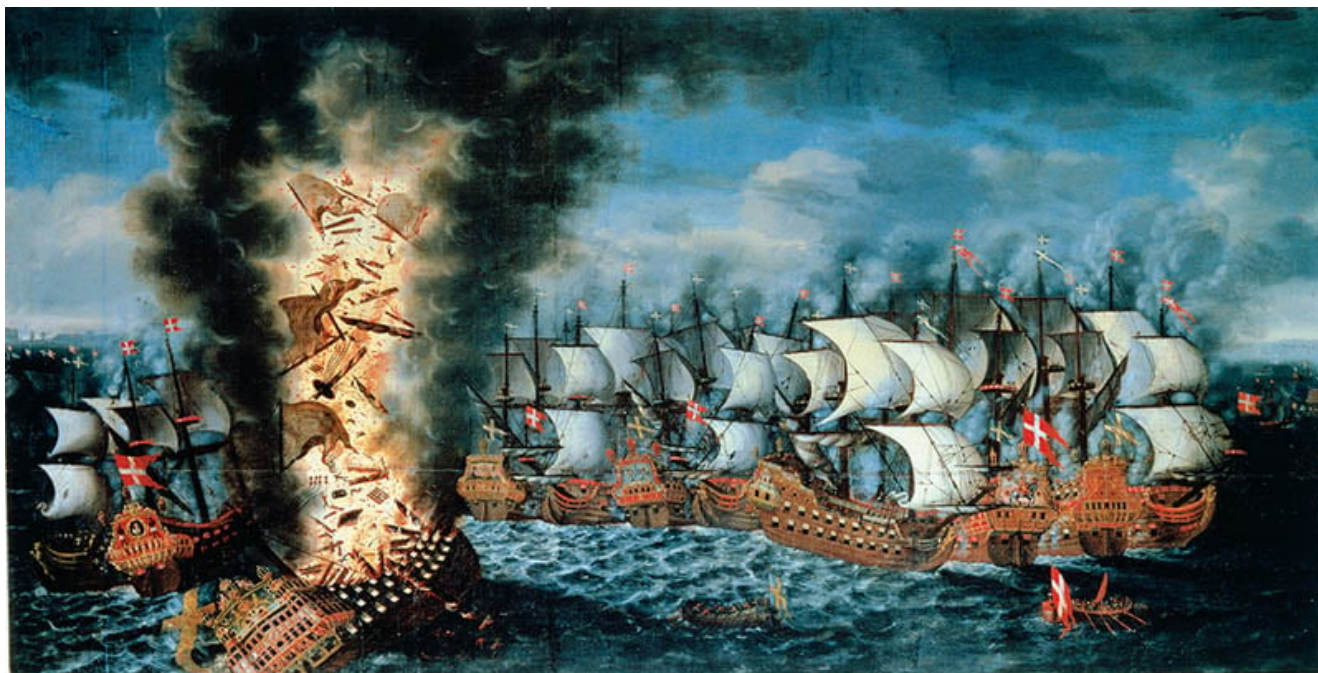
Battle of Öland, Claus Møinichen, 1676

Southern Sweden, known as Skåne (Scania in English) with its own distinctive regional flag in red and yellow (see illustration) was in terms of historical memories, even language, as well as physical geography, landscape, soils, vegetation, and climate much more similar to the remainder of Denmark than to the rest of the Swedish peninsula.