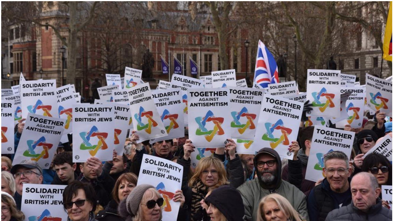
Rally in Parliament Square, London a few days before the election.

As an American Jew who now lives in the UK, it was especially gratifying for me to learn of the signed statement of solidarity with the Jewish community issued a week before the election by leading British writers, artists, actors, journalists (all non-Jews), who also took an unprecedented step in condemning Corbyn for avoiding answering the charges raised by Jewish Labor Party Members of Parliament and activists who had vainly attempted to get him to take effective action against the initiators of numerous instances of anti-Jewish (not simply anti-Israel) statements.