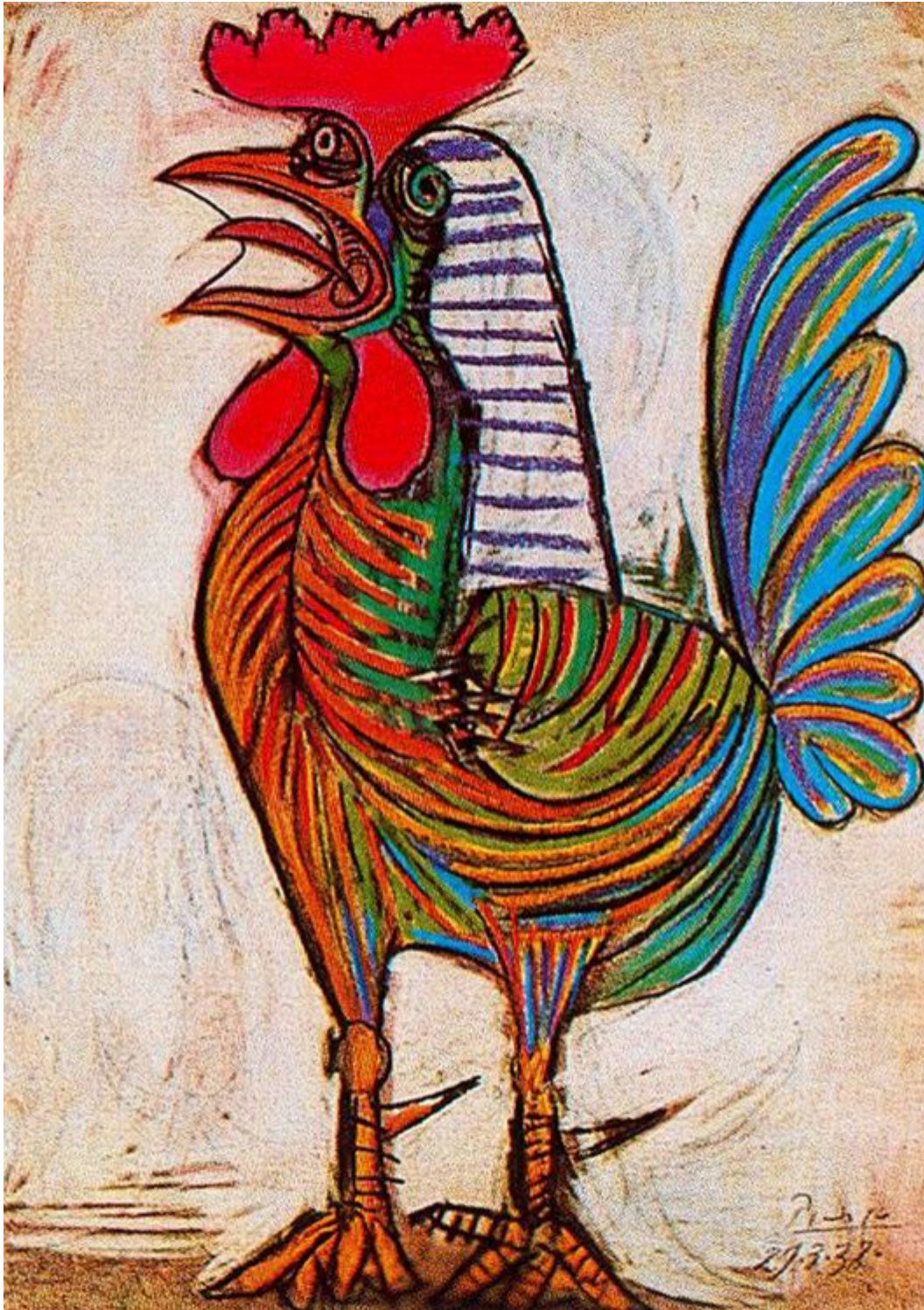
A Rooster, Pablo Picasso (1938)