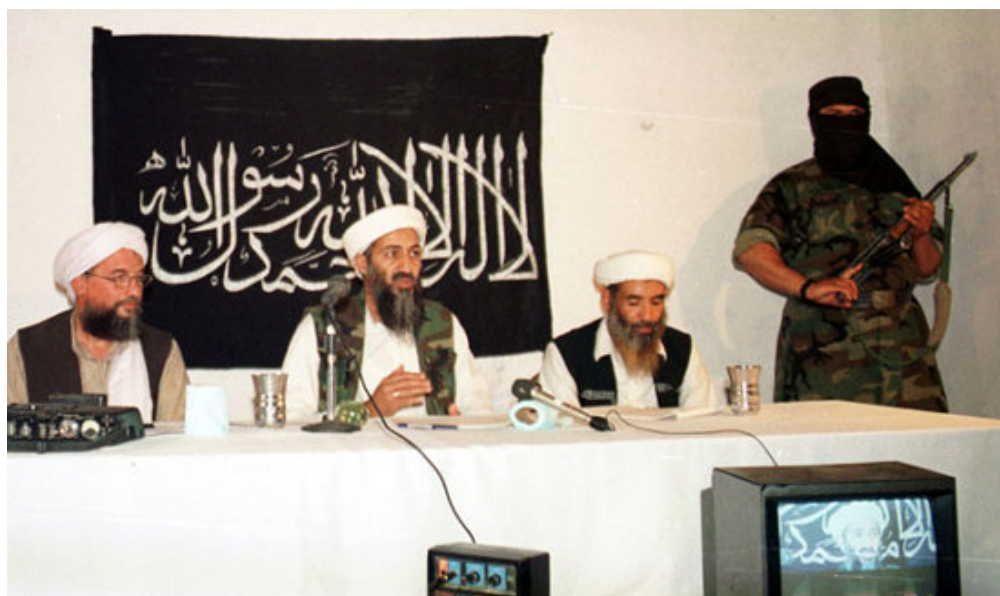
Ayman al-Zawahiri, Osama bin Laden and Mohammed Atef (Feb 1998 Kandahar press conference)

A merger of Al-Qaeda and ISIS would be eminently logical. From the anarchists of the late Nineteenth century to the founding fathers of the global jihad in the late Twentieth century, terrorists have long asserted that their goals will be achieved only when individual vanguards coalesce into a unified movement.