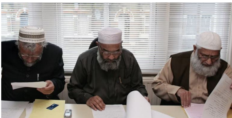
The Sharia Council of Britain presiding over marital cases at their east London headquarters

Therefore, the audacious push for the legalization of Sharia in Western democracies is nothing short of a bold attempt to subvert the very principles upon which these nations were built. The Muslims, driven by an unrelenting desire to impose their archaic worldview, are exploiting the freedoms and tolerance of these democracies to advance their sinister agenda. It is a Trojan horse of the most insidious kind, threatening to unleash a tsunami of darkness that would engulf the bedrock values of these societies.