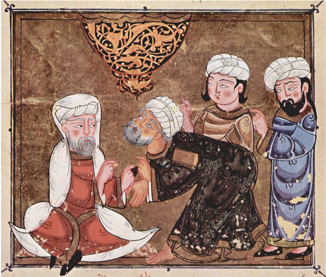
Abû Zayd pleading before the qadi (judge) of Ma'arra, c. 1334.

Respect for the rule of law , as it is understood and practiced by civilized people, is an instrument of convenience to be used to advantage and to be violated when it is not for the Muslim. A Muslim believes in a different law—Sharia Law: a set of stone-age rules. Violation of the non-Muslim laws,