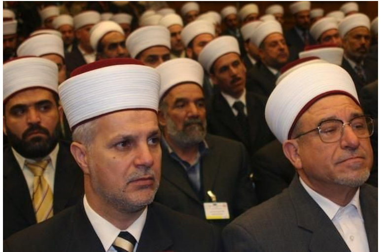
In Jordan, Muslim Sharia judges attend an Arab conference on Islamic law.

influence creeps beyond the confines of Muslim matters, insinuating itself into the lives of both Muslims and non-Muslims. The ominous implications unfold like a dark tapestry, weaving a narrative of subjugation and injustice transcending cultural boundaries.