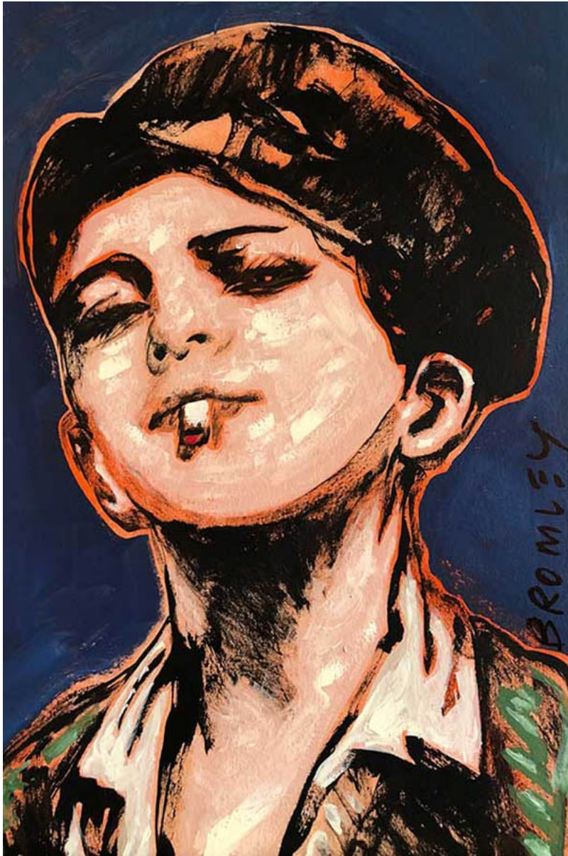
Smoking Boy , David Bromley

I know that rich white people call poor white people trash. And the only reason I know that is because I made so much money last year, the rich whites told me; they say it at a cocktail party. Dave Chappelle