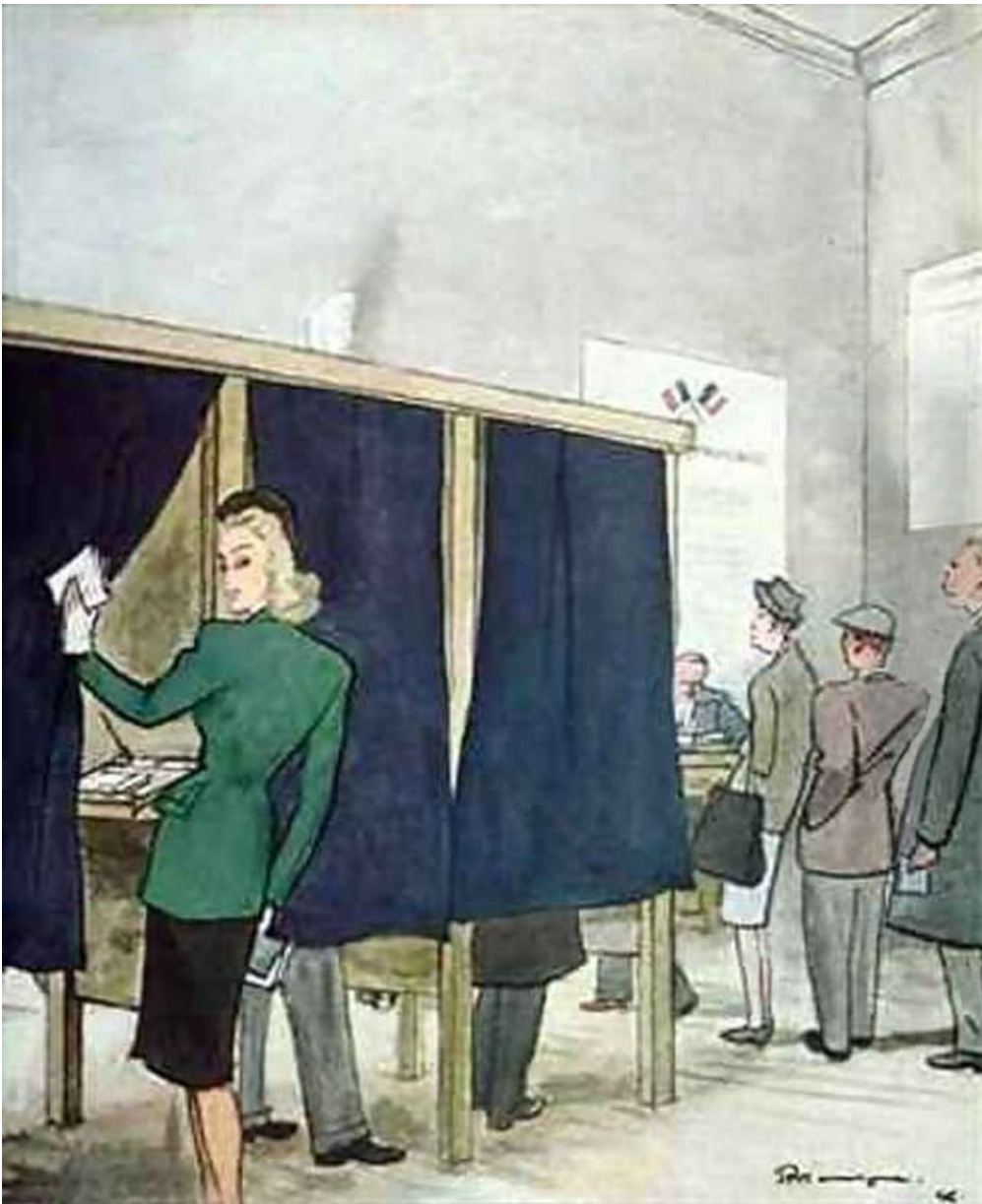
Illustration by Pierre Mourgue

If voting made any difference they wouldn't let us do it.