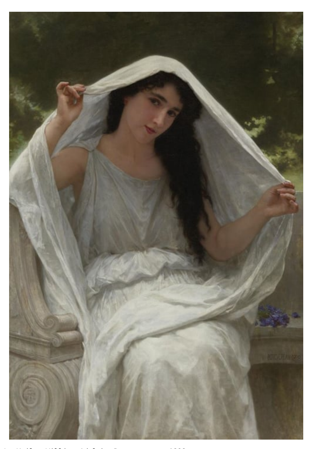
Le Voile, William-Adolphe Bourguereau, 1898