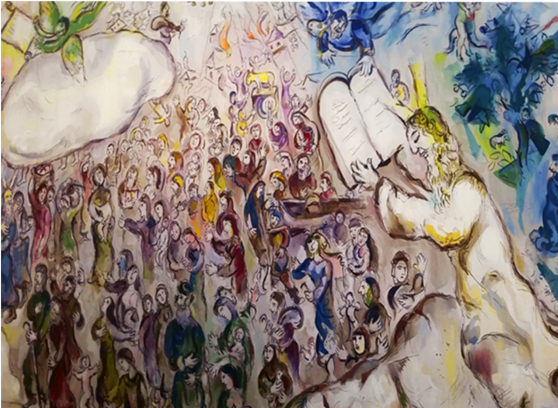
Detail of tapestry at Chagall State Hall, Marc Chagall