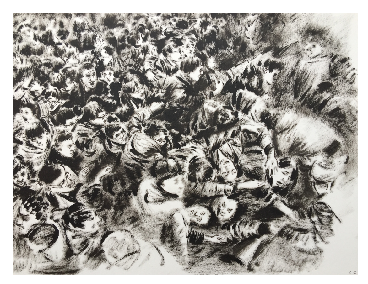
Crowded People, Lu Chao, 2015