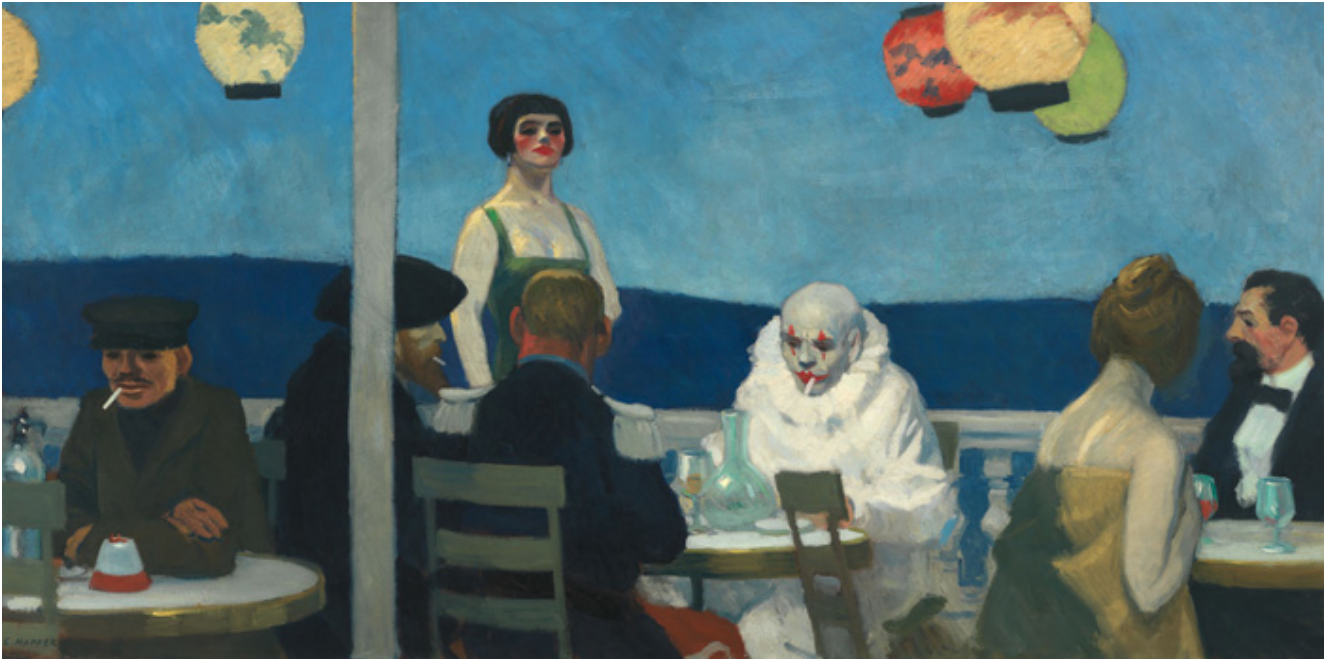
Soir Bleu , Edward Hopper, 1914