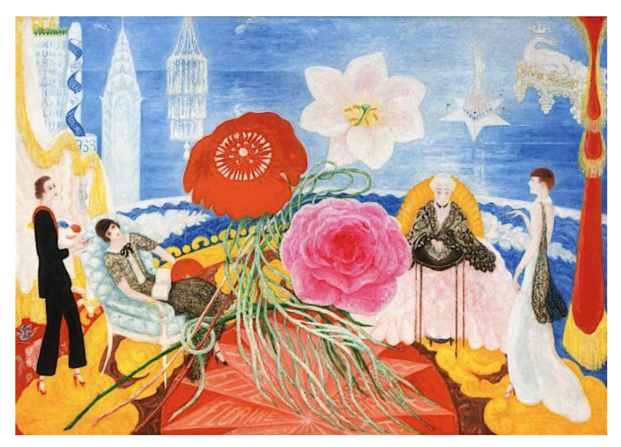
Family Portrait II, Florine Stettheimer, 1933

by <u>Jeffrey Burghauser</u> (December 2019)