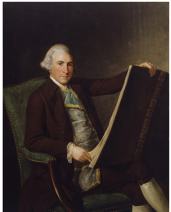
Portrait of Robert Adam, by George Willison, 1770-75

As I read the book, I pondered the question, impossible to answer but not therefore without point (contrary to what the logical positivists might have said), of what Robert Adam would have done if he had been born in our time rather than in the time in which he was born. After all, if Mozart were born today, he would not compose what we now know as Mozart. The man needs the time, but the time needs the man.