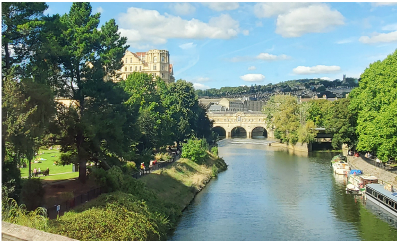
Pulteney Bridge by Robert Adam, Bath, England

I suppose I should declare an interest at the outset: I will mention favourably a book by one of the editors of a magazine for which I write, the New Criterion .