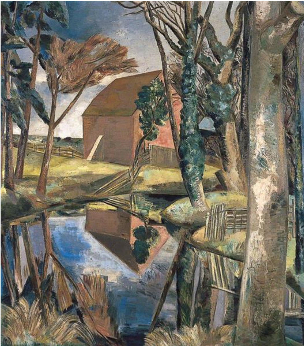
Oxenbridge Pond (Paul Nash, 1927-28)