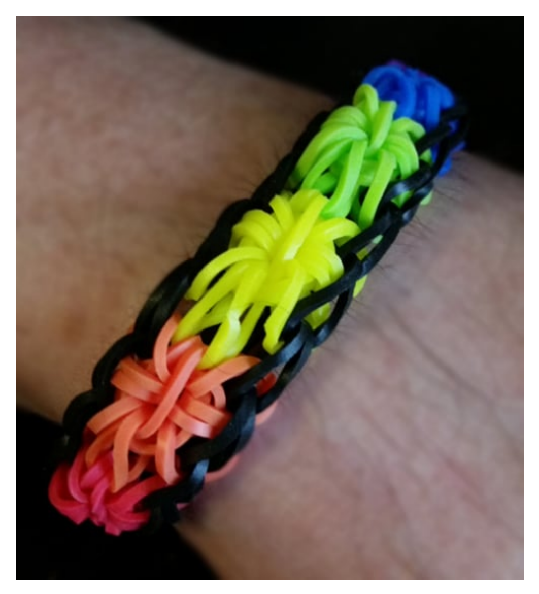
Bracelet made by Corbin, 3/24/19