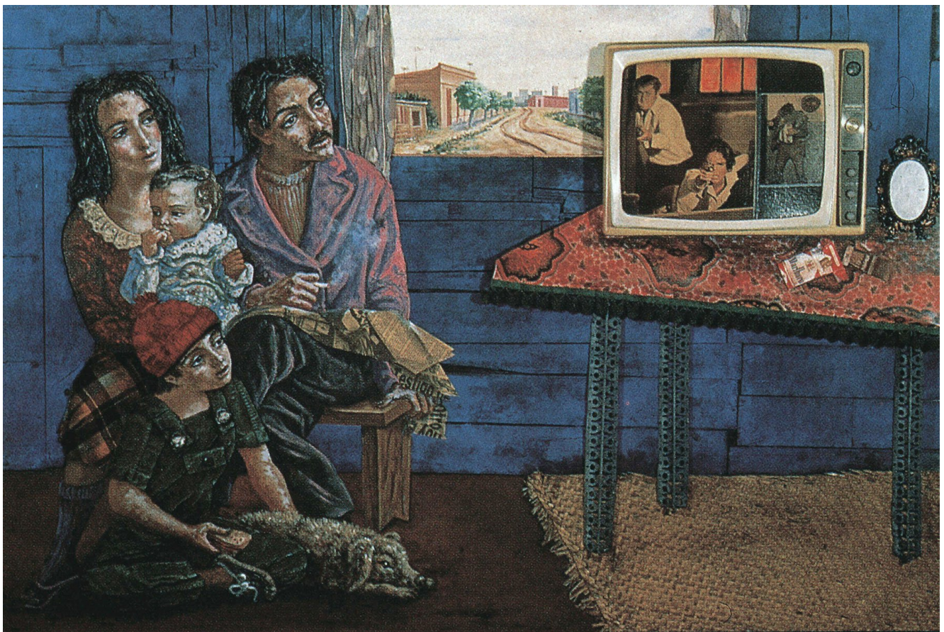
Juanito Laguna's Family Watching Television (Antonio Berni, 1977)

This is the third, and final installment in a series of exploratory essays regarding our current political situation (Part One: “On Persuasion, Crowds, Christianity, and Our Farcical Politics” and Part Two: “The Sovereign Individual” ), and then these final thoughts presented here