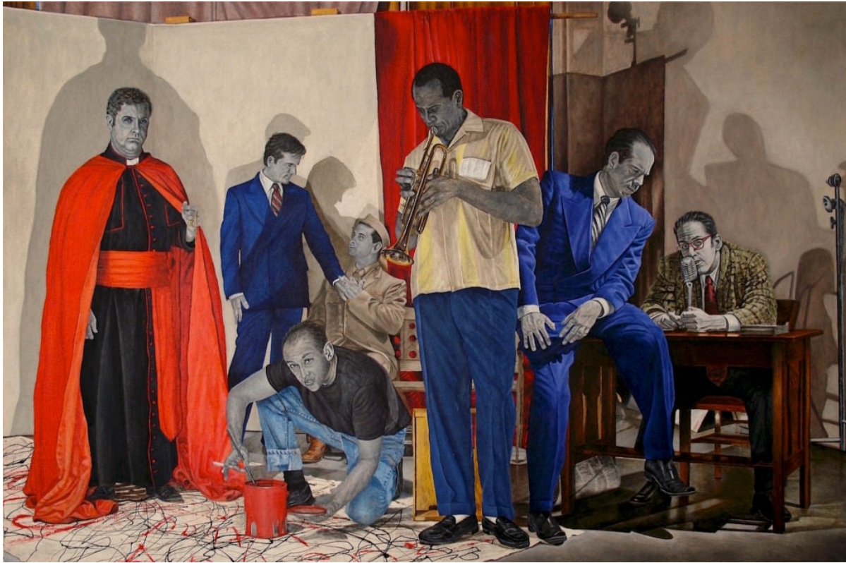
How to Wage a Cultural Cold War , Eugene Rodriguez, 2011

Early May saw the latest skirmish in the ongoing culture wars. The inevitable result of an endlessly documented and commentated-upon world, these battles seem always to occur in the Anglosphere, probably because the English-speaking world is ground-zero for the madness of ideas like microaggressions, cultural appropriation and 'healthy at every size'. Consider the furor surrounding a London Underground advert for protein shakes in 2015 which featured a bikini-clad woman sultrily exhorting the viewer to get 'beach body ready'. Looking svelte and fit, the model didn't appear remotely anorexic, and the