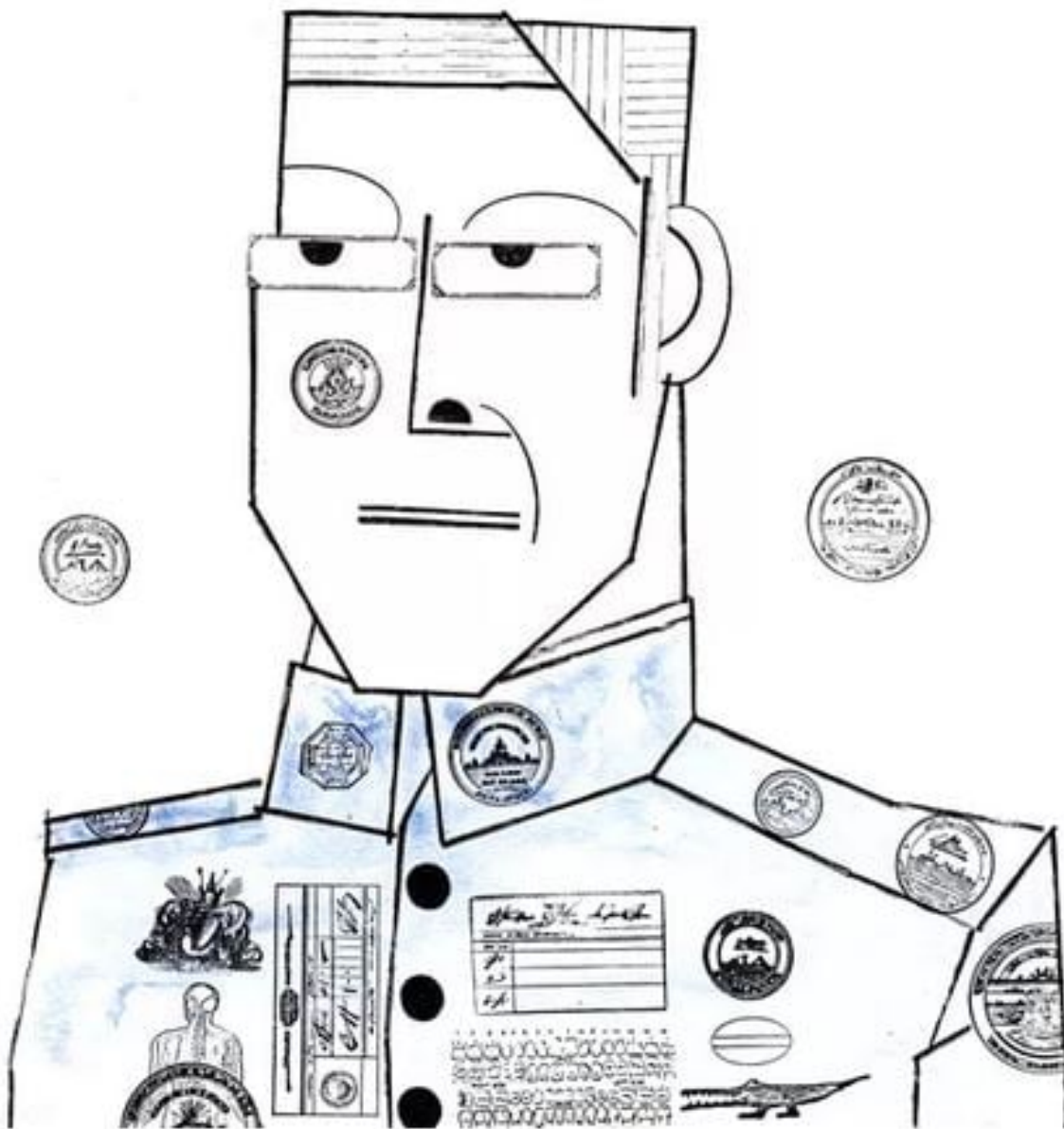
Lithograph by Saul Steinberg