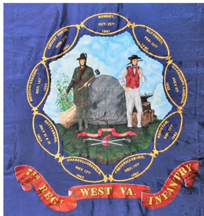
Flag of 7th West Virginia Infantry Regiment of the Union army (Southern white men who fought and died to preserve the Union and abolish slavery)

Almost 120,000 Unionists from the South served in the Union Army during the Civil War and Unionist regiments were raised from every Confederate state except South Carolina. These men were often in complete disagreement with the wealthy eastern planters. There were similar groups elsewhere in the border and upland South for whom “white privilege” was not their shared heritage with the despised wealthy slave owners who had forced civil war upon the country.