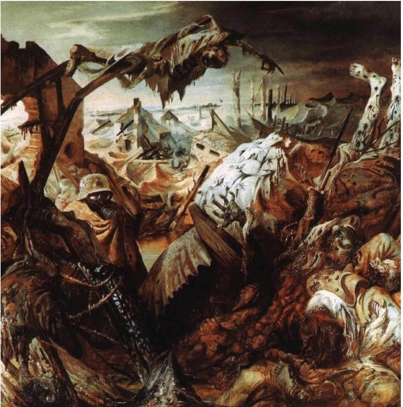
The Trench , Otto Dix, 1923