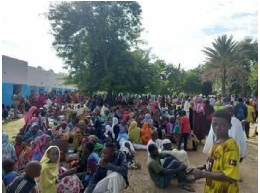
Internally displaced people in Blue Nile State followed the tribal clashes, Radio Dabanga (Photo Courtesy: Musa Zambulu)

to exploit the continent's rich resources.