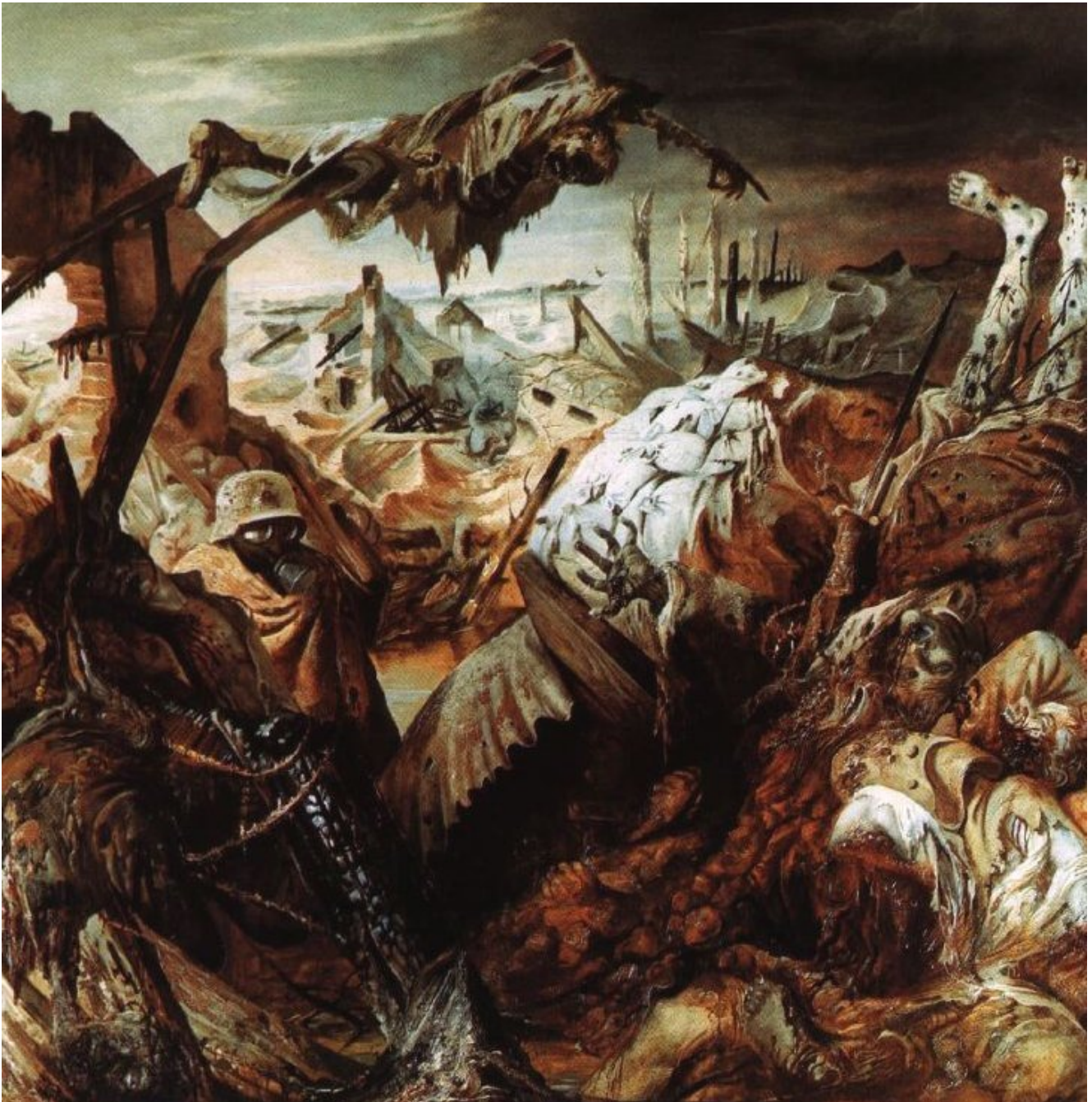
The Trench , Otto Dix, 1923