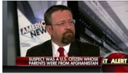
Dr. Sebastian Gorka