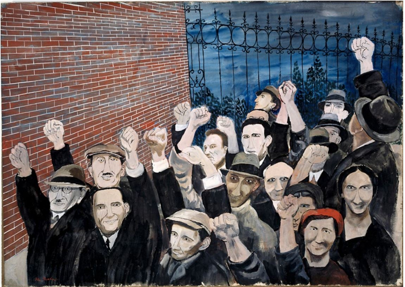
Demonstration , Ben Shahn, 1933