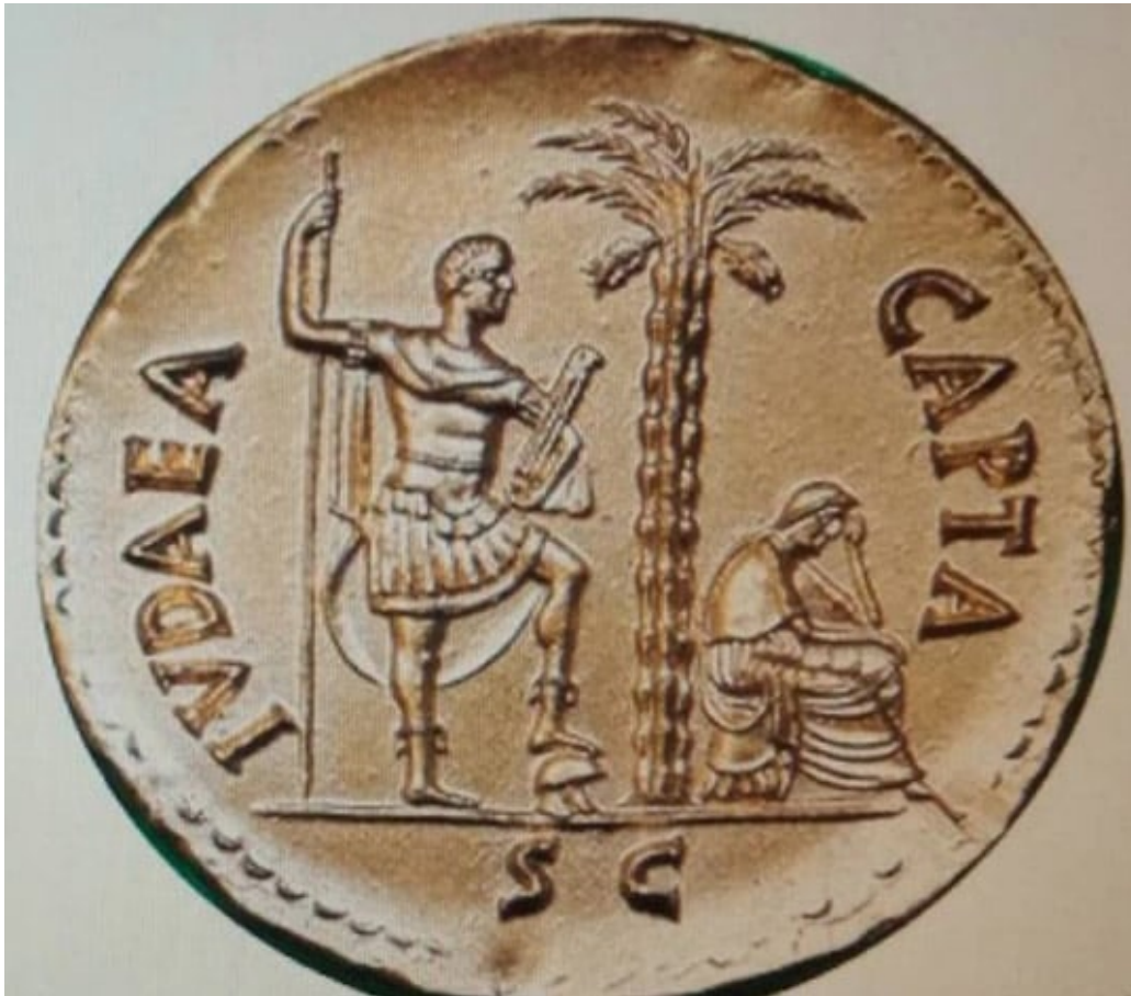
Iudea [Judea] Capta coin

Due to painful Family matters , as fate would have it, I found myself living in Rockville, Maryland to be near my son in 2024.