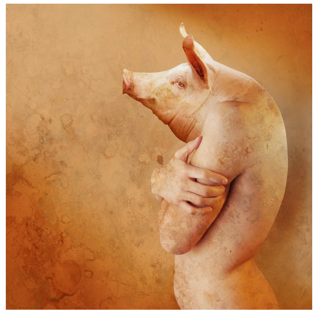
"Those capable of tyranny are capable of perjury to sustain it." — Spooner

Mendacity is the currency of modern American politics. Truth, it seems, is now a function of what an advocate is willing to sell and gulls are willing to buy. Words like "objective" and "impartial" compete with "non-partisan" and "non-profit" in vacuous newsrooms across the Media spin circuit.