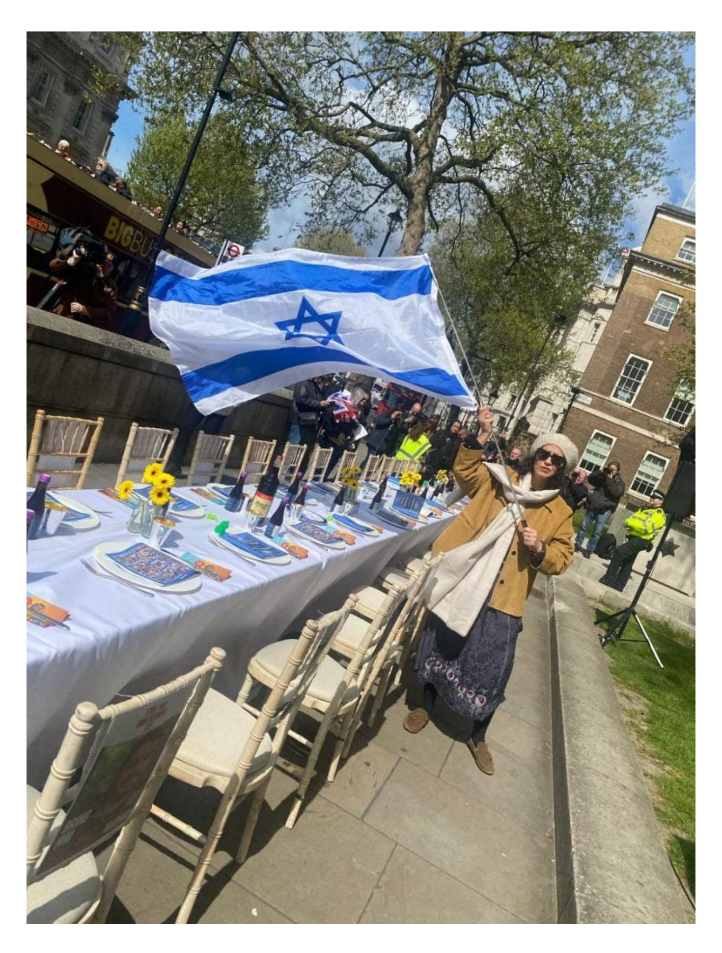
The installation featured 133 empty chairs, each one representing a hostage in Gaza, ranging from those for infants