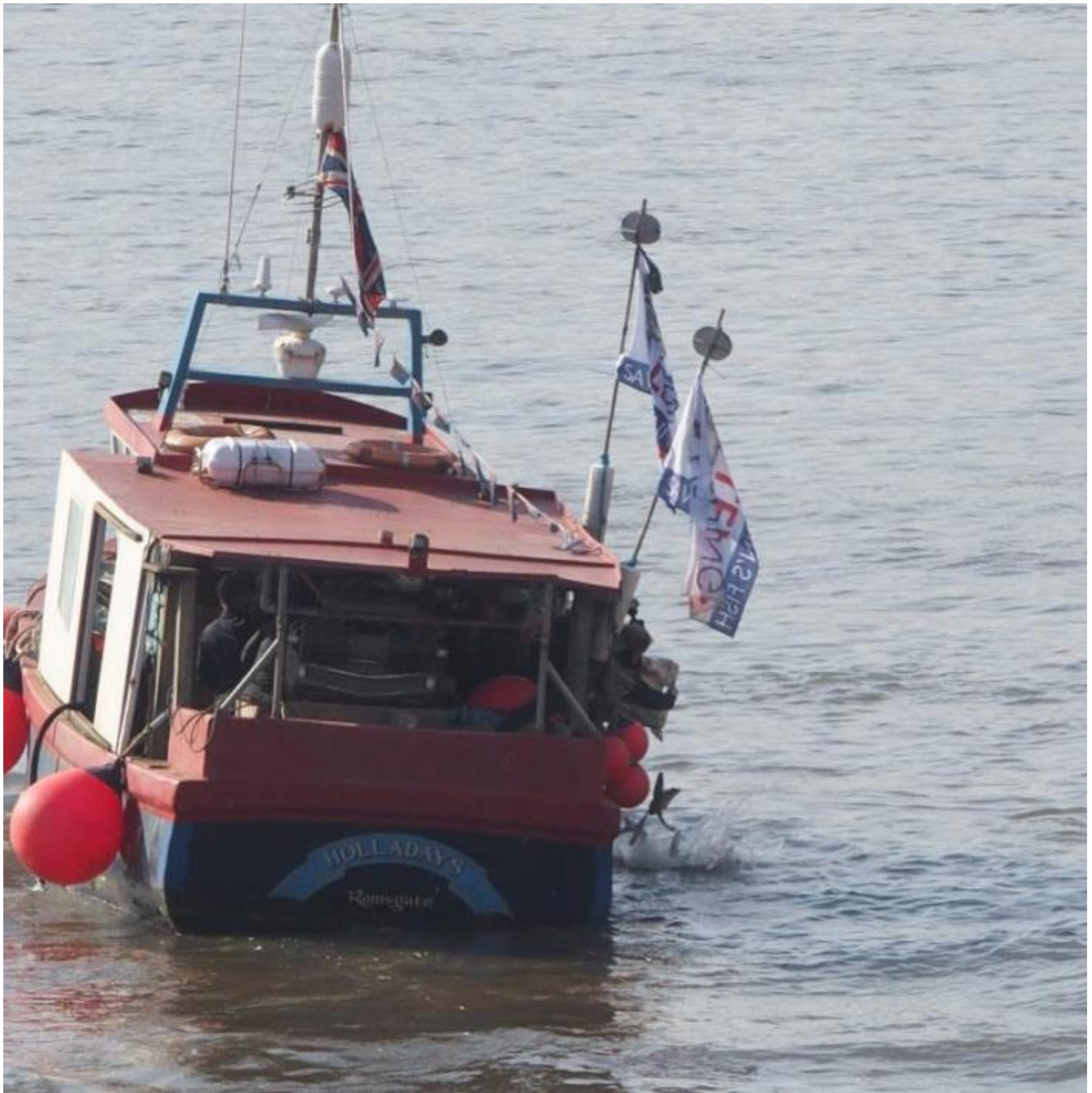
The fish went in one by one.