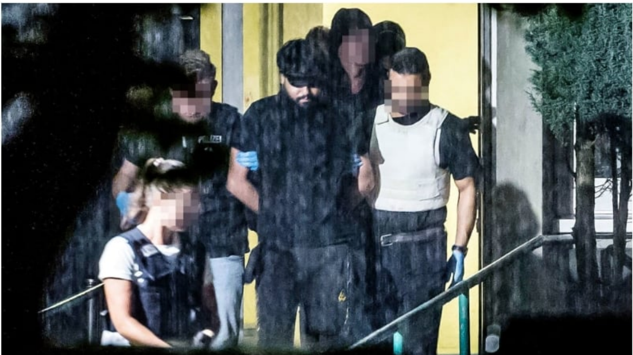
Police officers lead away the suspect (center, black clothes)

As BILD learned, a mantrailer dog had led the investigators directly from the place where the knife was found to the asylum home on Wupper- / Goerdelerstraße in Solingen (). The special unit then surrounded the building and finally stormed it at 8:18 p.m. A suspect was arrested. Whether the man is connected to the crime is currently being investigated. In addition, the investigators are questioning residents of the home.