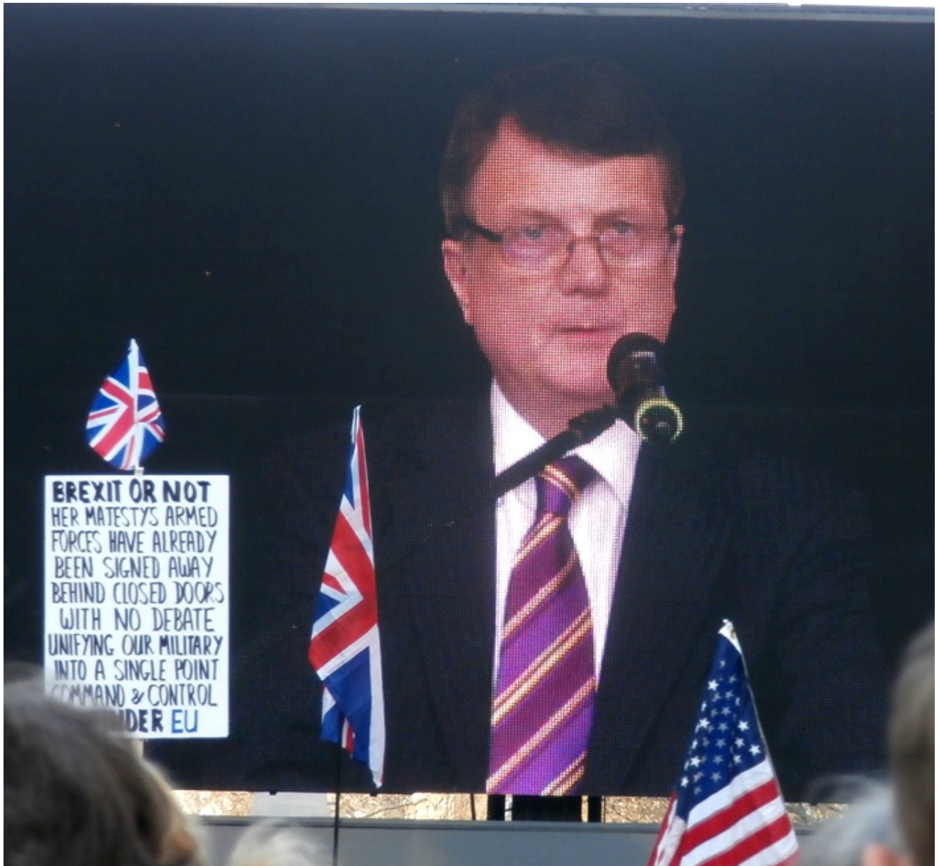
Gerard Batten, leader of UKIP was making his first speech as I arrived.