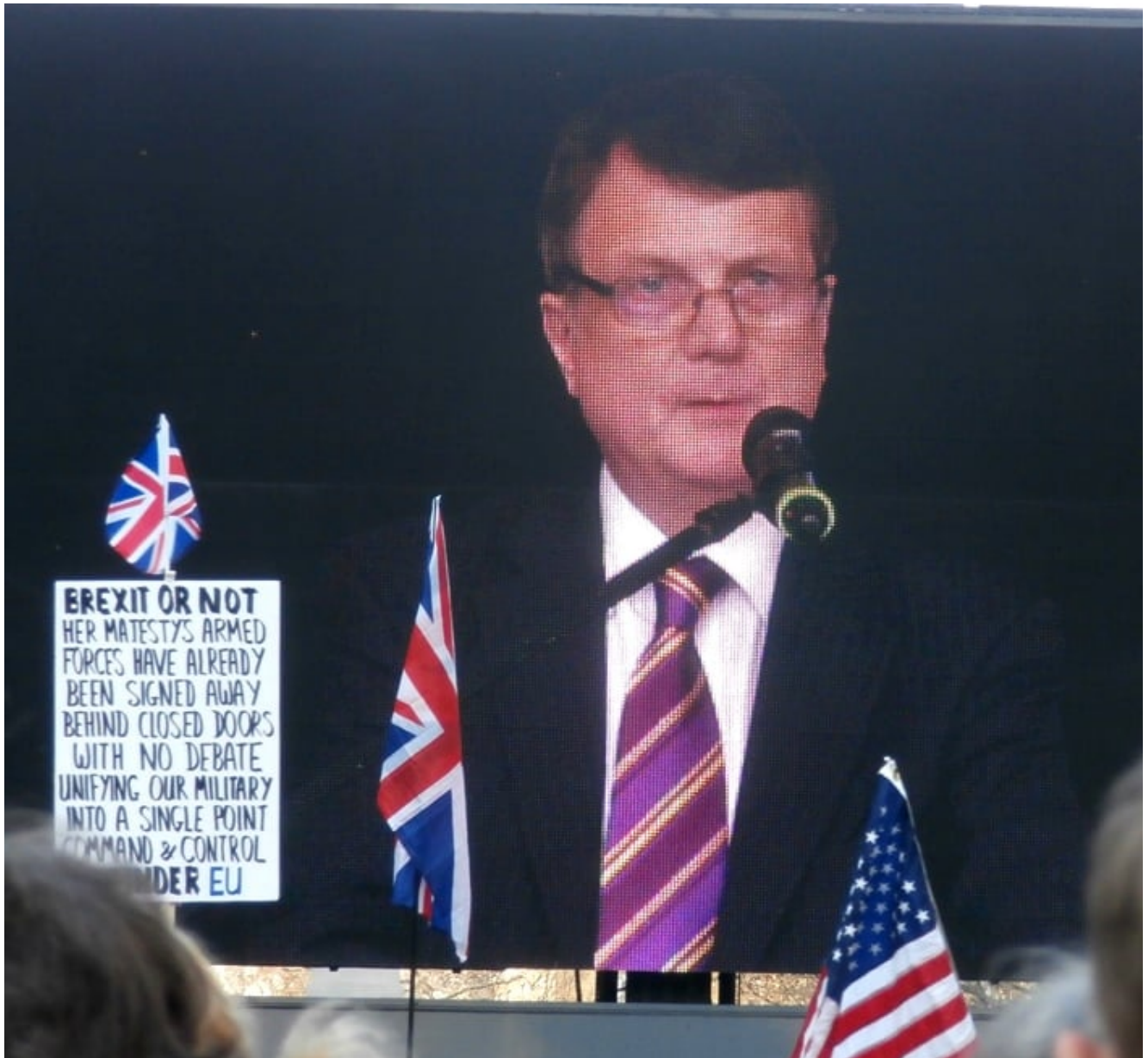
Gerard Batten, leader of UKIP was making his first speech as I arrived.