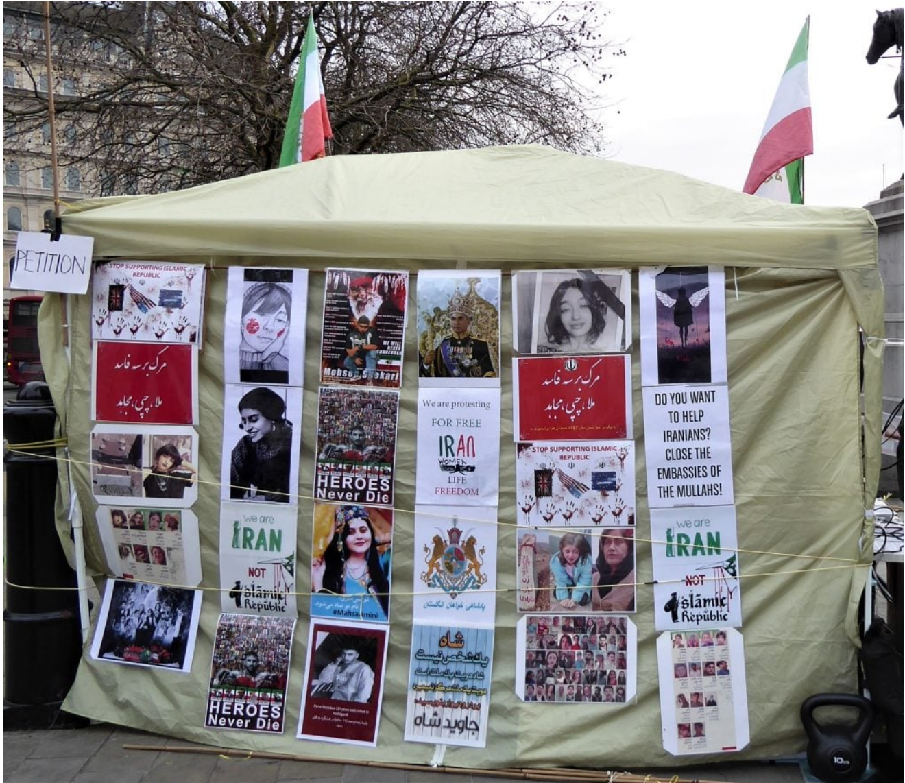
London January 2023