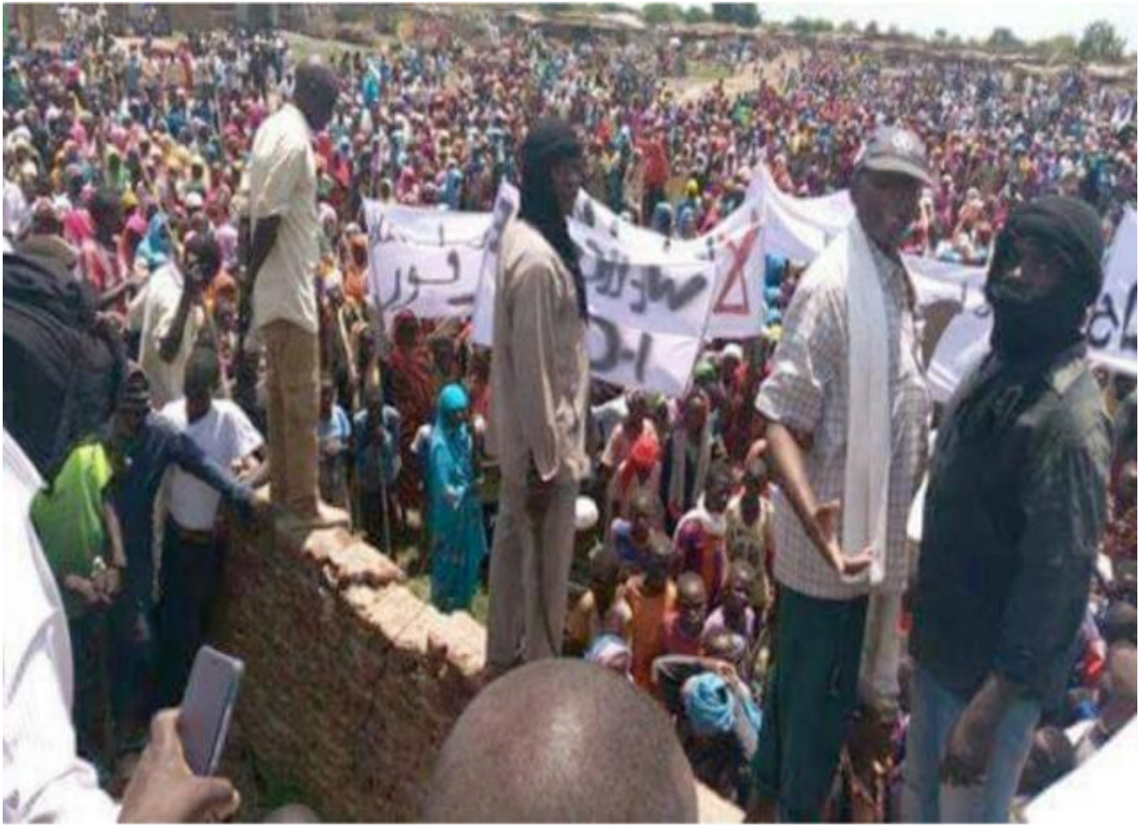
Kalma Sudan IDP Camp Protest in Darfur