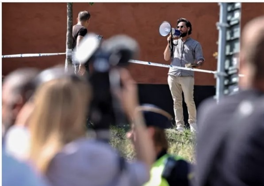
The Iraqi anti-Islam campaigner Salwan Momika burns a copy of the Quran outside the mosque in öädermalmä

Turkish foreign minister Hakan Fidan condemned the act in a tweet, adding that it was unacceptable to allow anti-Islam protests in the name of freedom of expression.