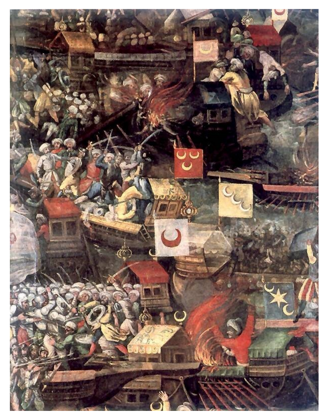
Battle of Lepanto: Ottoman Navy, detail from the painting by Tommaso Dolabella (1632)

As a result, today addiction is ubiquitous in the West driven by the myth of enhancing creativity and productivity. Addictions like gaming, technology, pornography and all sorts of chemical compounds are a toxic brew that can drag down any society. I suppose, this insight might be the topic after terrorism to unite East and West in disgust. Meanwhile absurdity pivoted in the US with transsexuals posturing, of all things, as soldiers in the US military. As it turns out, it took the populist President Trump to prevent them joining