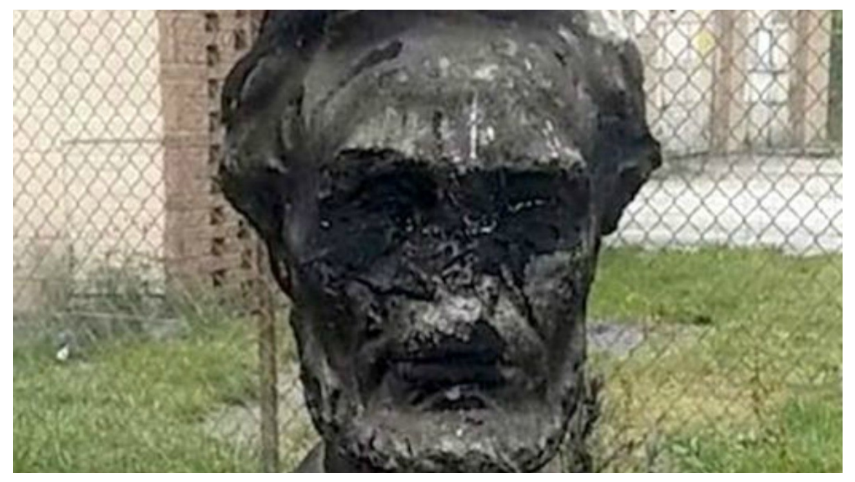
Antifa vandalizedthis bust of Abraham Lincoln

If anything is not the infamous Protestant proselytizing furor and missionizing zeal alive and kicking with its new global gender warriors neatly combined with the boycott of Israel.