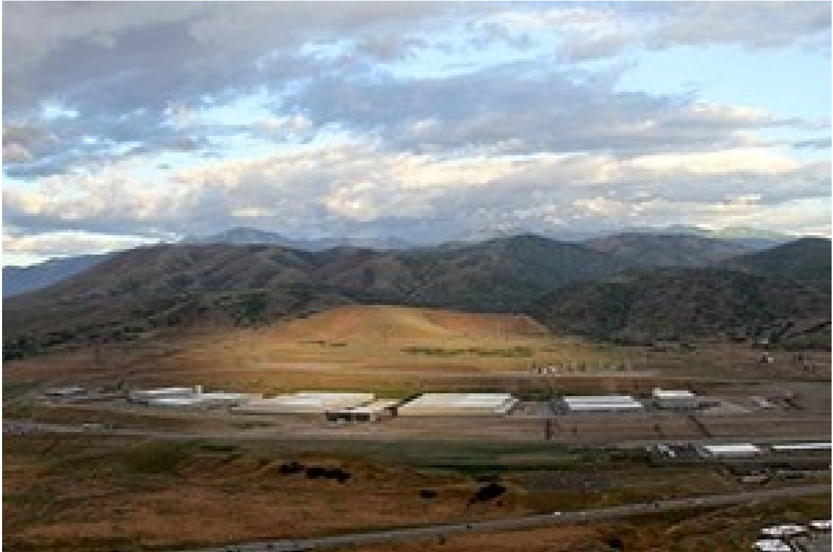
Bluffdale Data Center, Utah

The “stake” in stakeholder capitalism goes through the heart of individual liberties.