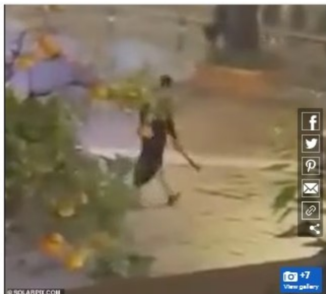
The assailant is pictured wielding a long blade

BARCELONA, Spain (AP) – A machete-wielding man killed a sexton and injured a priest in attacks at two churches in the city of Algeciras on Wednesday before being arrested, Spain's interior ministry said, in what authorities are investigating as a possible act of terrorism.