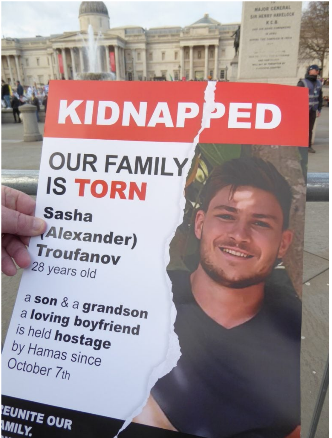
It wasn't quite the end but we decided to make our way slowly back to the station.