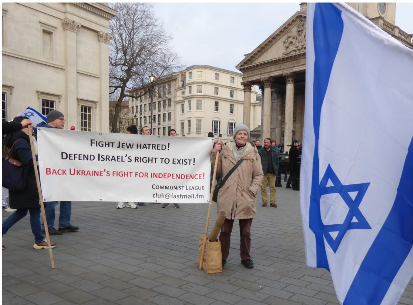
Some views across Trafalgar Square as the queues filed in and we listened to Israeli music.