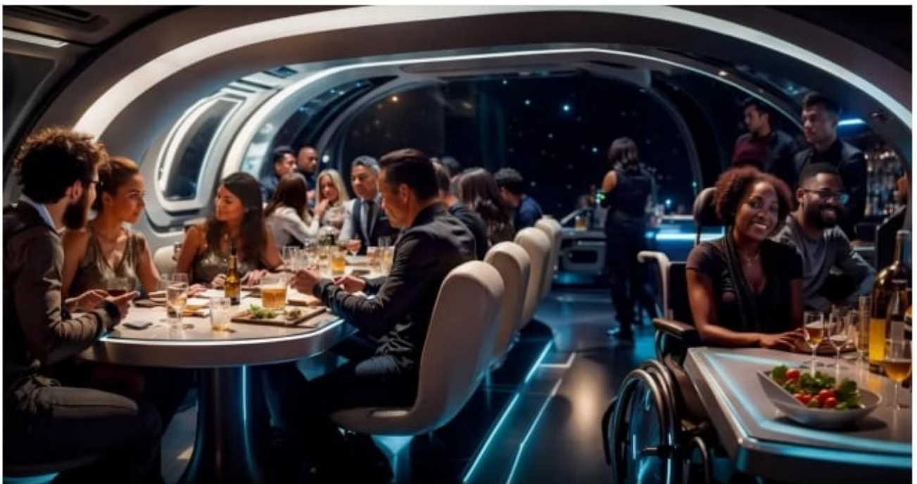
Dinner aboard a Mars-bound Starship, same source.