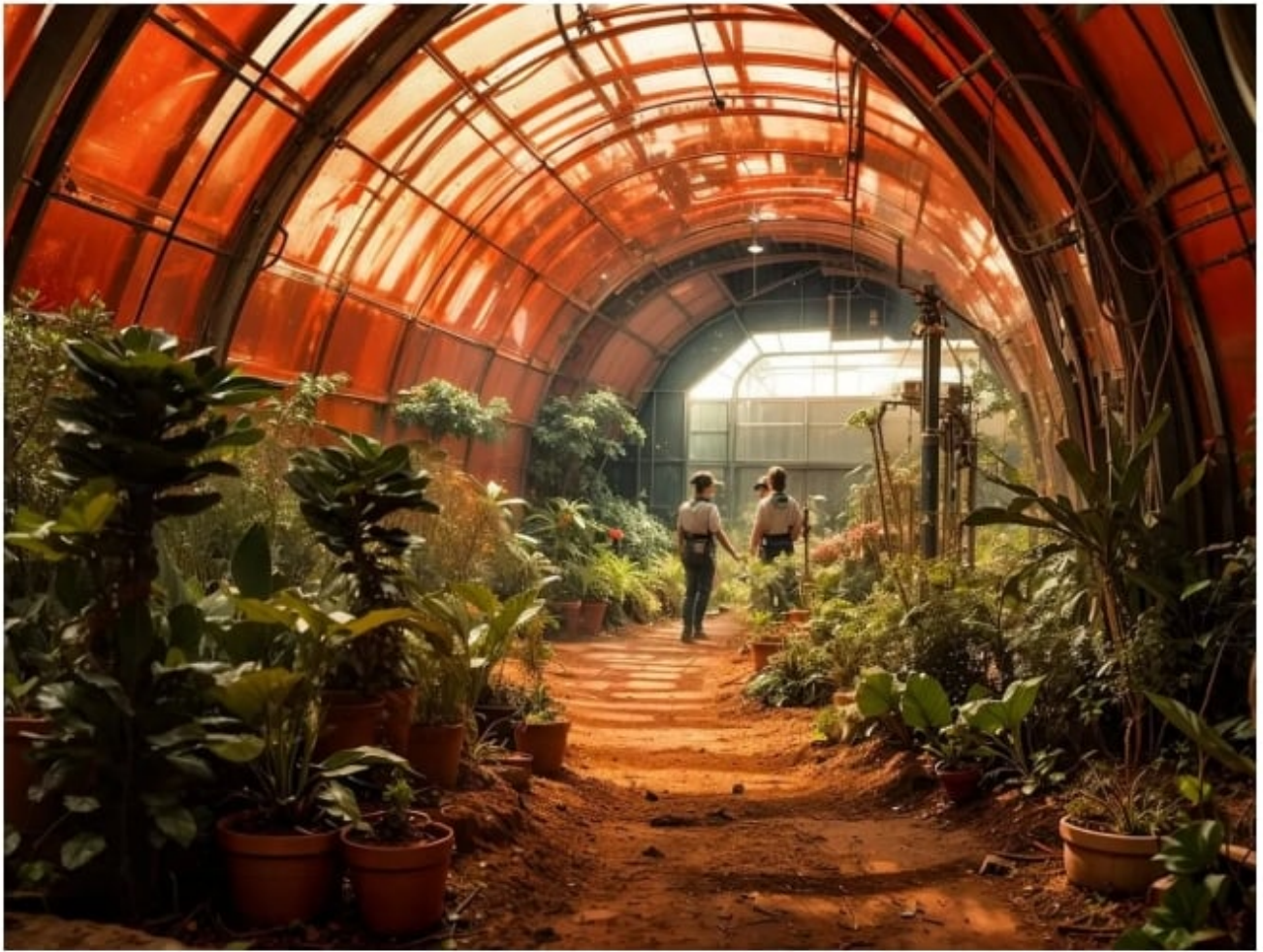
Martian greenhouse, from the Red Planet Resorts Instagram account.