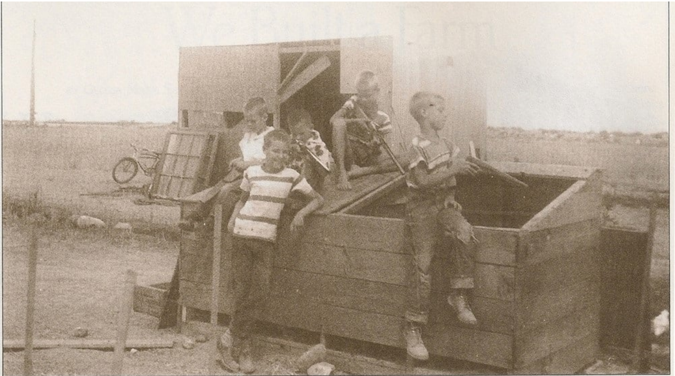
The children worked hard, but they played hard, too. Wooden rubber-band gun fights were a favorite.

My dad was a Kansas farm boy who worked his way through college to become a civil engineer. But he'd wanted a farm himself. Mom loved a challenge and had a penchant for hard work, so when the chance came to own a chunk of the newly opened Columbia Basin Reclamation Project, they grabbed it. Running a farm is a lot of hard work. Creating one is even more so. I remember the giant yellow Ukes, like great diesel carpenter's planes with huge rubber tires traversing back and forth across the sage land, scraping here and depositing there in order to "level" the land for irrigation. And I remember all the dirt and clouds of soil as the wind blew. The intent was to grade it just a bit off-level, so that the gradient from irrigation ditch to run-off ditch were just enough of a drop to make the row water trickle past at the proper speed for maximum absorption. Dad did survey work on the side, so he had his farm staked precisely. I remember riding on the cultivator, the fertilizer and seed hopper as we prepared the fields for our first crops. My crop was cantaloupe. I planted them in the triangle plot of ground where the tractor path bifurcated as it t-boned another. I remember harvesting the